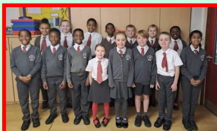
St. Joseph's Sports Council 2023-2024

After a rigorous screening process, our new Sports Councillors, who will help run clubs, sort equipment and raise the profile of PE and Sports in our school have been selected. Thank you all for your applications.